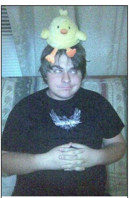
If you look closely you can barely see the assassin hiding in this picture. Part of earning masterhood is being a master of disguise.