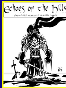
Emerald Hills Newsletter