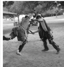
Eagleshire Crown Quails!

"Unifying citizens of the EH under one common banner since 1988."