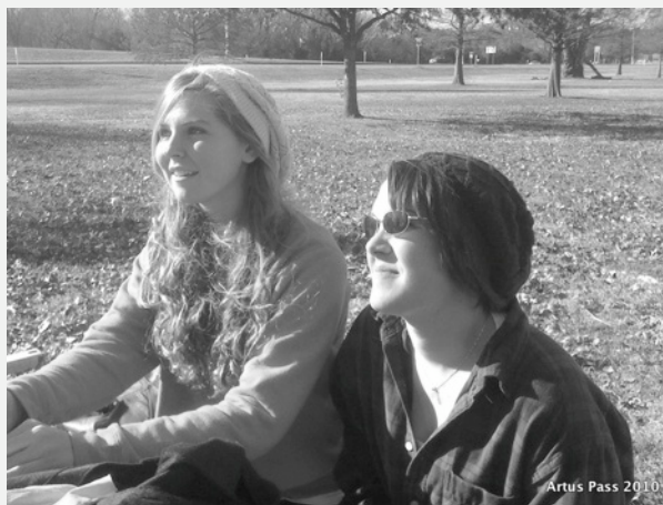
Some welcome visitors at Artus Pass