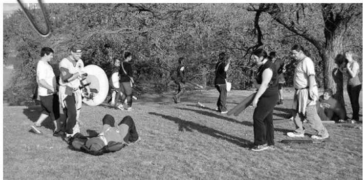
Battlegame at Mourningwood Glen

Echoes of the Hills is a continuing newsletter donated by members of the kingdom for the benefit of the kingdom of the Emerald Hills. Interested in providing material to this publication? Let us know!