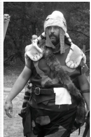
Torgas - great example of RP garb!