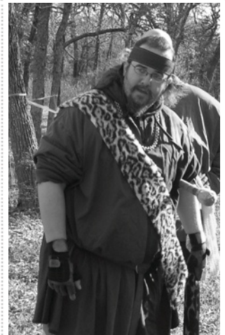
Sir Rayel Greenholde in Barbarian Mode