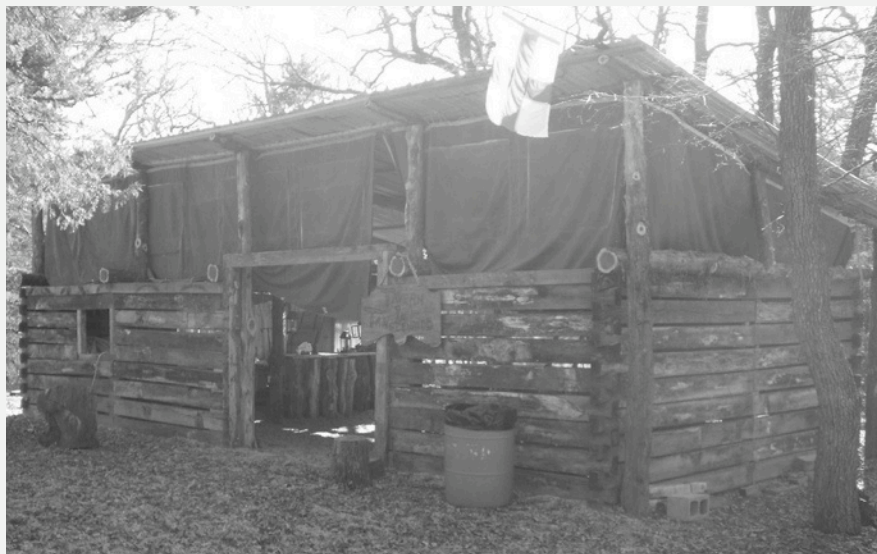
The Tavern in Tanglewood

Here's to Amtgard! And New Friends! To all who aren't here, which means we all get more of this cheer!! Who said that? OH, don't you start ...Can you pass me more beer? Happy Holidays all and a Merry New Year!!