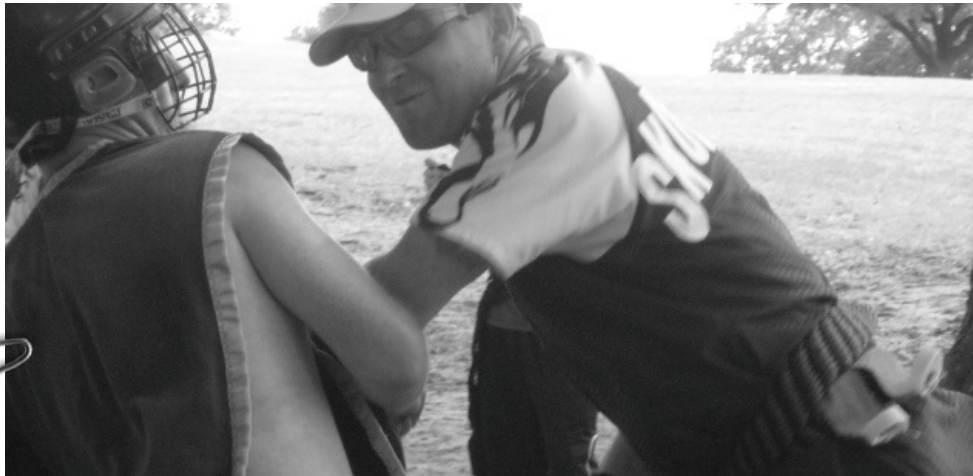
Tuk! vs. Skullband