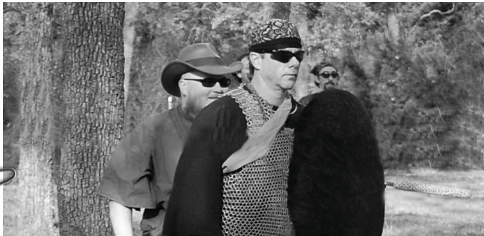
Sir Nevron Dreadstar and Duke Elder Vermilion in a kingdom battlegame

In Service, Lady Carmony Uziel Prime Minister of The Emerald Hills