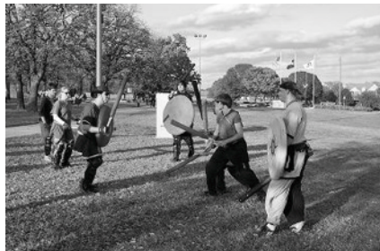
Warriors on the battlefield!