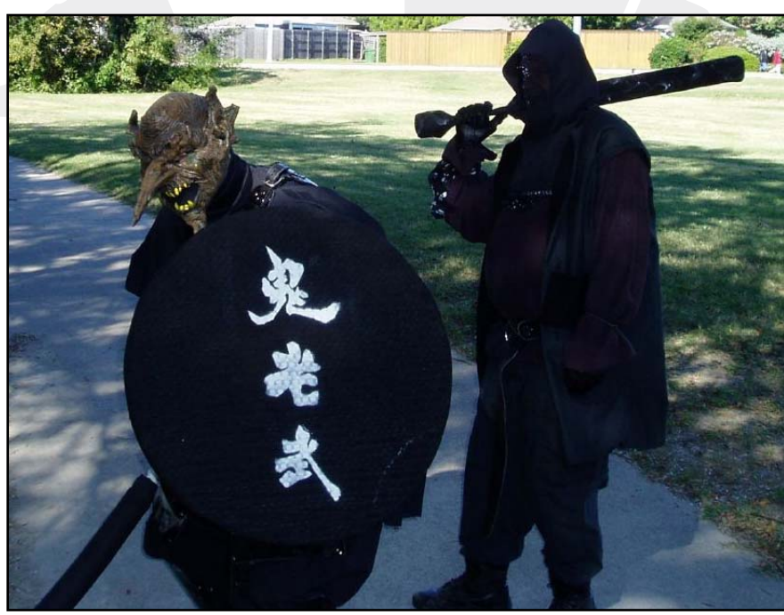
A Shade and Elf protecting the Midnight Forest