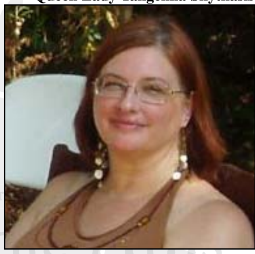
Newsletter of the Emerald Hills