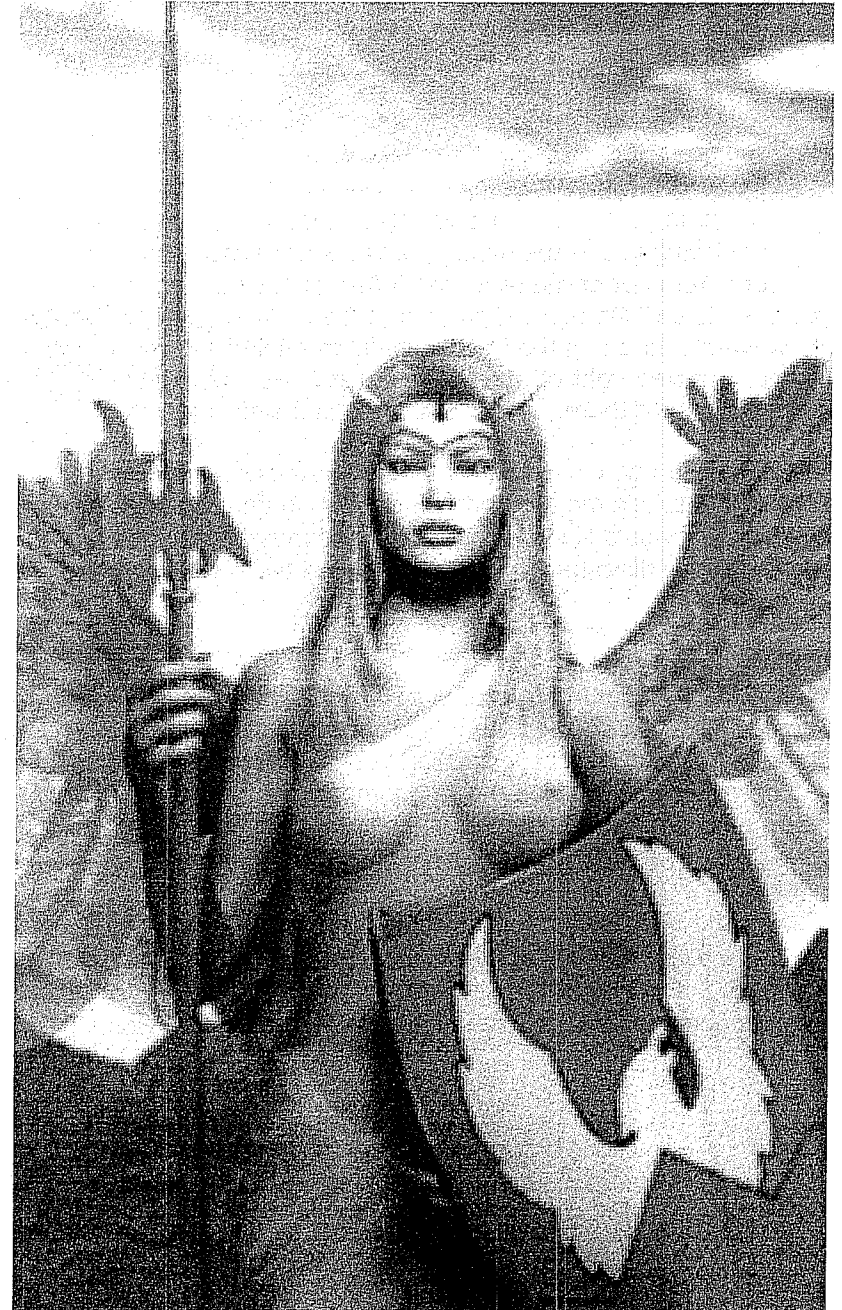
Art by Sean Carlton

Judgment of the single entry classifications will be based on: Excellence of the workmanship 50% Aesthetic impact 50%