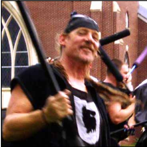
King Sir Trinity Skythasis