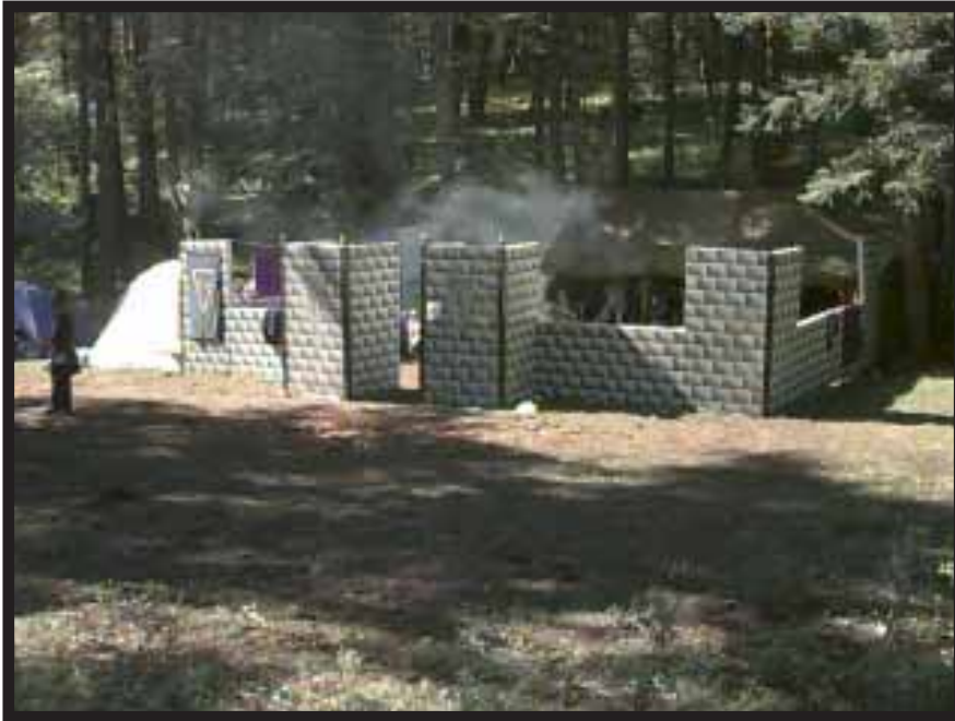
Clan XIV - Zol's Castle in the Claw Legion Camp