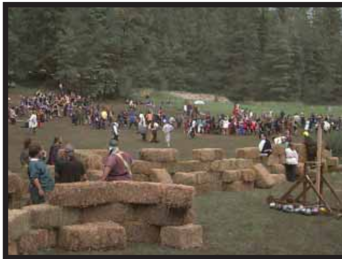
Clan XIV - The Army of Evil wins the war!

Any submissions you have for the next newsletter need to be to me by August 9, 1997. And, don't worry, I won't waste your time by simply putting a new cover on the newsletter and giving you the same content each week.