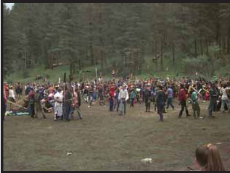
Clan XIV - More battles from last Clan