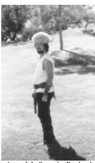
Asmud da Satyr by Raphael