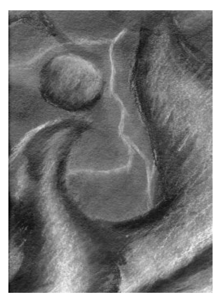
Black Phoenix Rising by Raphael