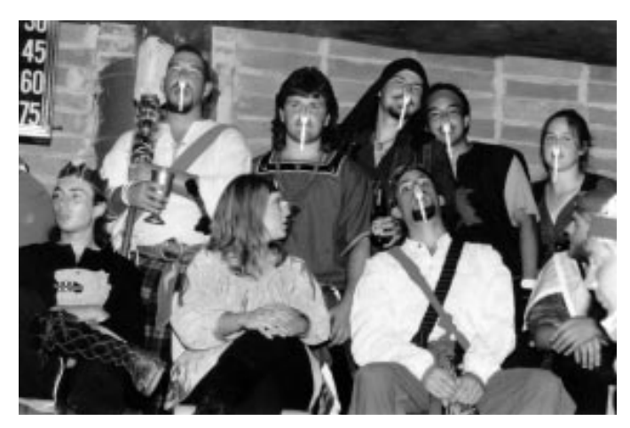
Court is a very serious matter for Burning Lands and Emerald Hills (by Gilos)