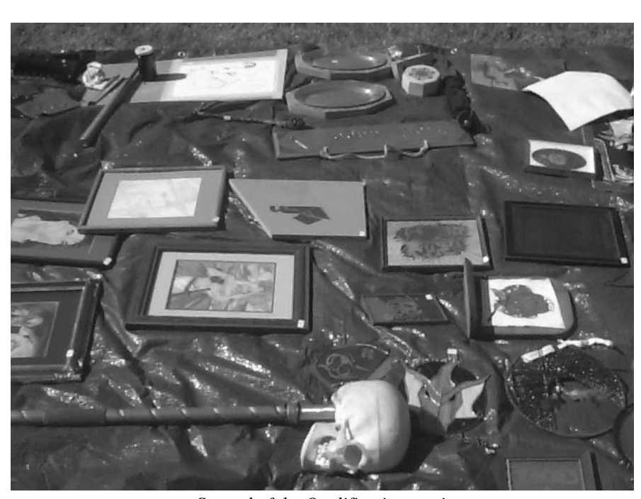
Several of the Qualification entries