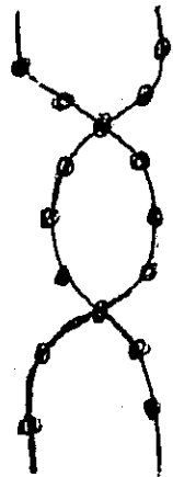
E.H. DNA STRAND

Despite all of these startling facts, we the Smack Tabloid, must stress to the populace of C.K. not to be alarmed. You do have your place in society as our Peons, and everyone needs someone to step on.