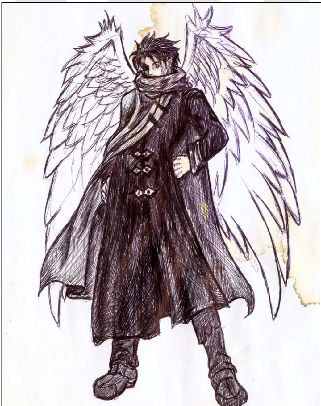
Layout/Design [Sutra Bahuas]